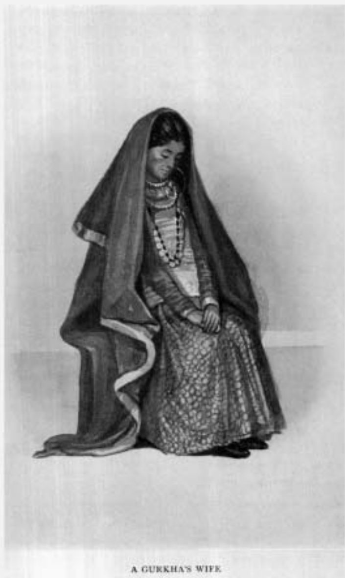
A GURKHA'S WIFE